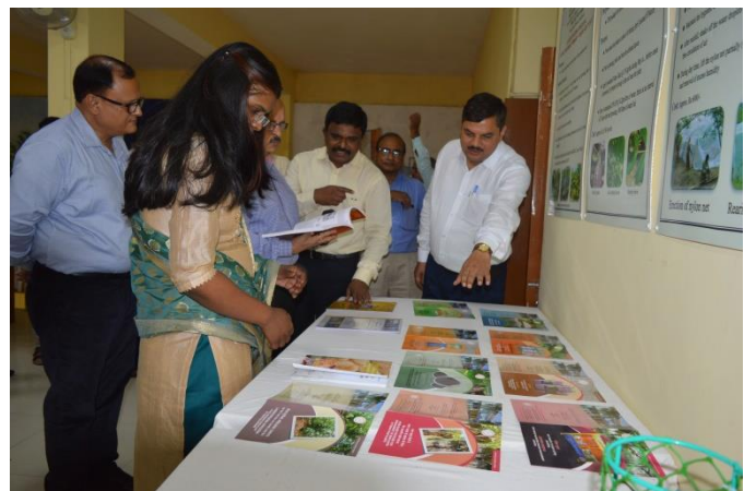
Visit to technology exhibition stall