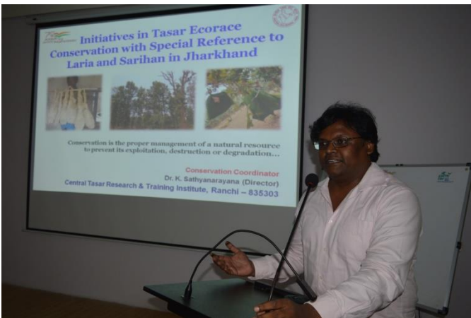
Technical session by the scientist