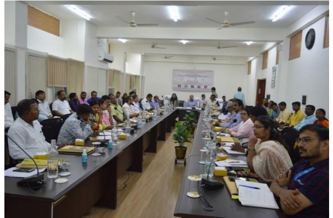
Director, CTRTI, Ranchi briefed on the core theme of the workshop