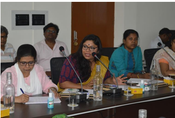
Open house discussion by the stake holder