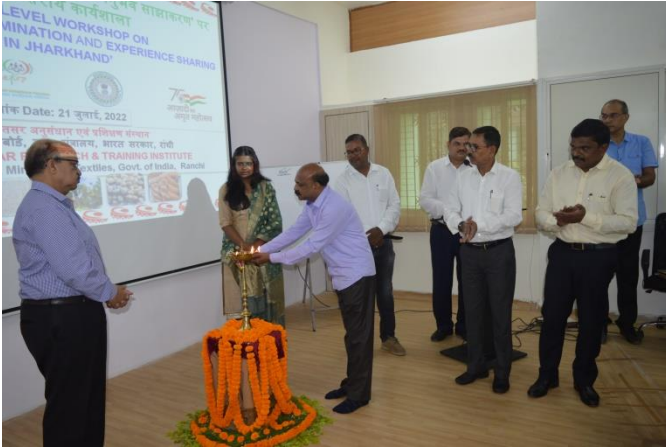
Lighting of the lamp by chief guest