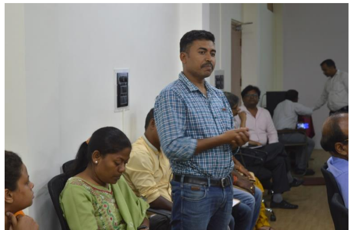
Open house discussion by the stake holder