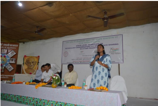
Address by the chief guest