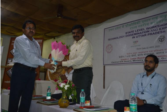
Welcome of the guest