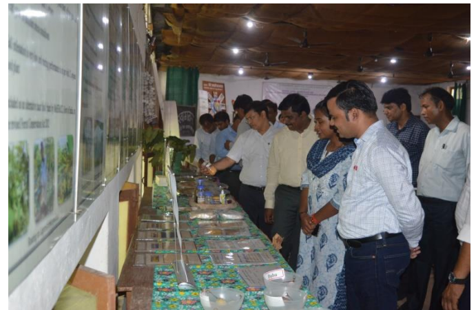
Visit to Technology exhibition stall