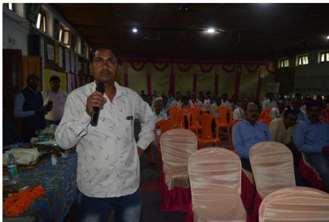
Open house discussion by the stake holder