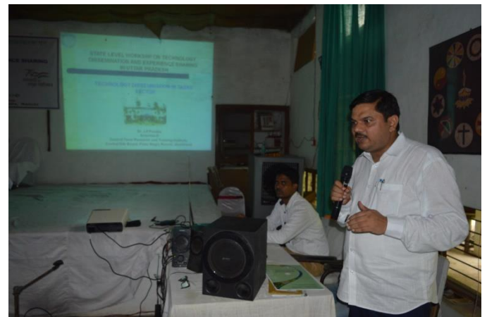
Technical session by the scientist