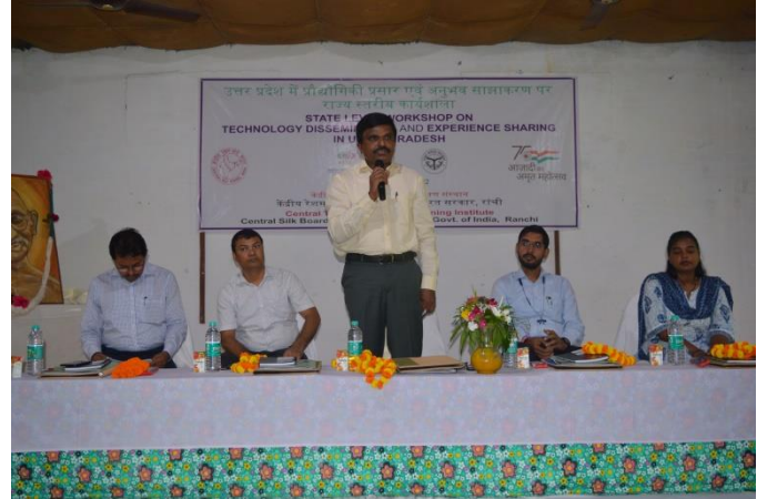
Director, CTRTI, Ranchi briefed on the core theme of the workshop